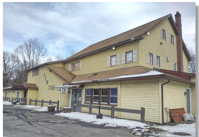
Red Hook VFW Post 7765—30 Elizabeth St., Red Hook, NY